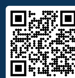
DOAS for journals