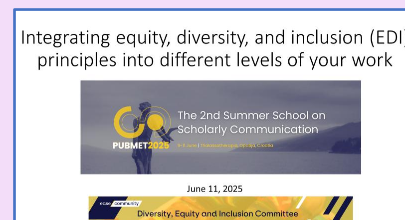
Workshops for the scholarly community