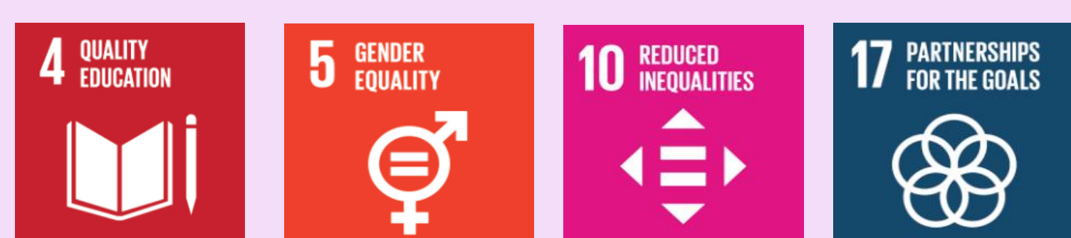
Cross-community collaboration with the Lancet Group, C4DISC, and EASE's Environmental & Sustainability Committee, among others